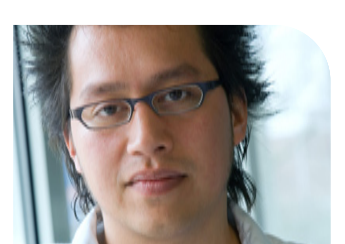
IT / Network Administration

'I want a system that's compatible with my environment and that evolves with it'