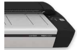
Contex Extended Data Transfer Rate improves scanner speed at high resolution