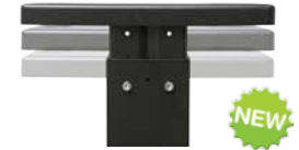
Designed for optimal ergonomic working environment. Height adjustable stand in 3 positions.